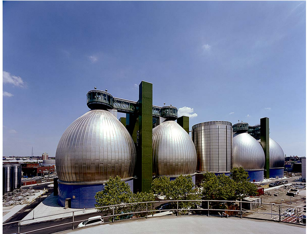
Picture of Newtown Creek waste water treatment plant in Brooklyn, NY.