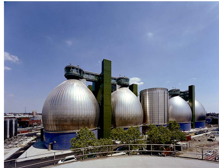
Picture of Newtown Creek waste water treatment plant in Brooklyn, NY.